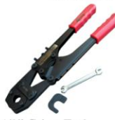
1/2" Crimp Tool