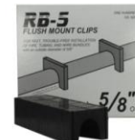
Flush Mount Clips