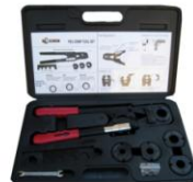
3/8", 1/2", 5/8", 3/4" and 1" Multi Head Crimp Tool