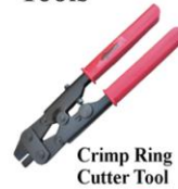
Crimp Ring Cutter Tool