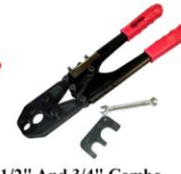
1/2" And 3/4" Combo Crimp Tool